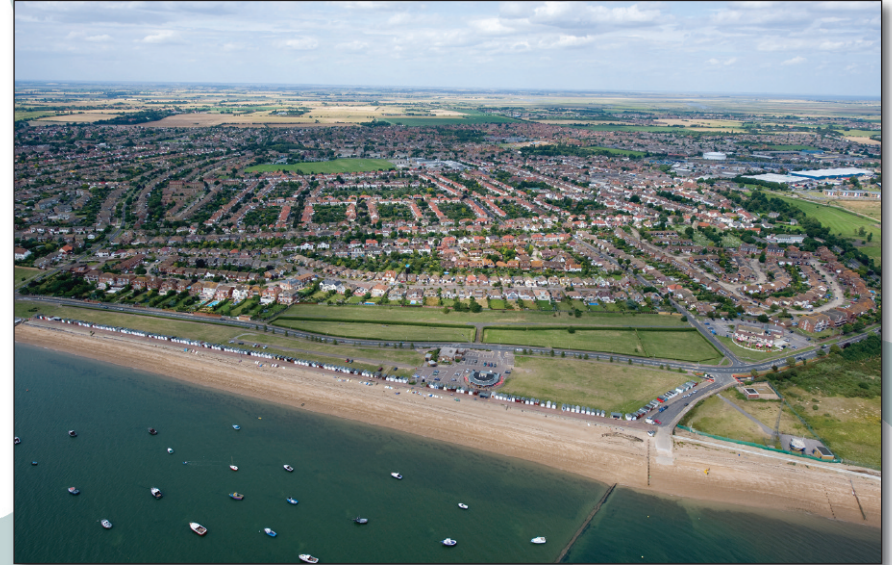
A spectacular view over Thorpe Bay.