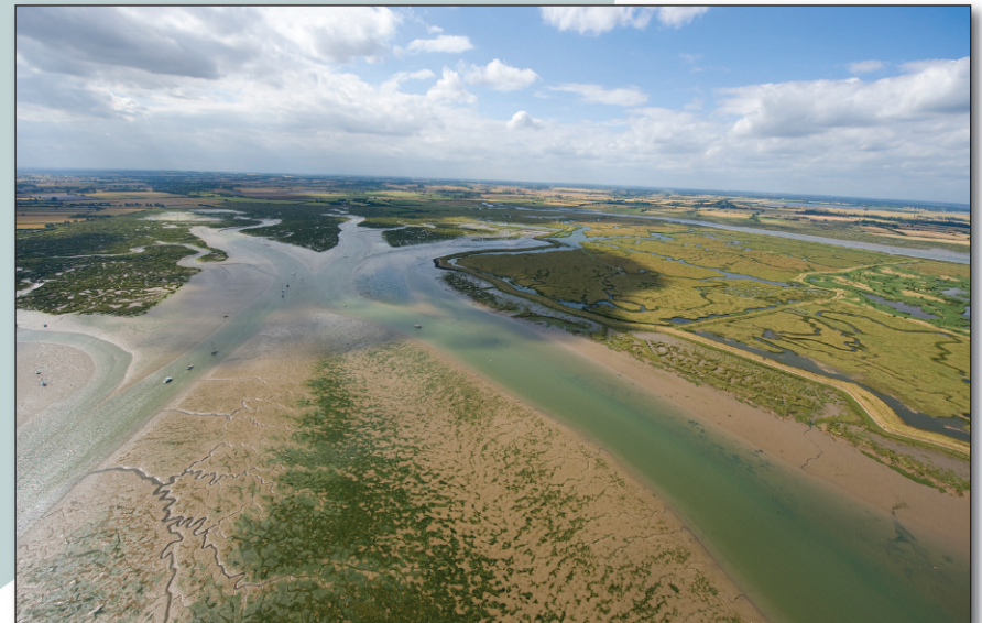
Mudflats and saltmarsh neat Tollesbury Fleet and Old Hall Creek.