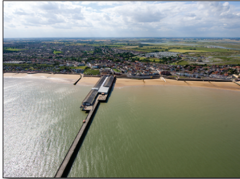
The pier at Walton-on-the-Naze.