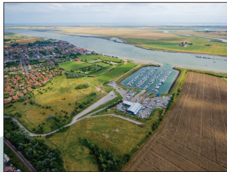
Burnham-on-Crouch: a paradise for sailors.